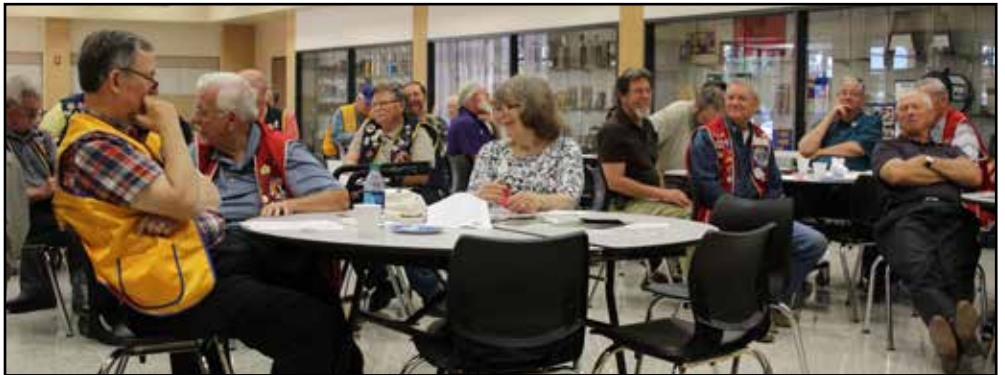
More than 60 Lions and guests attended the first District meeting held July 23 at the Post High School Commons.