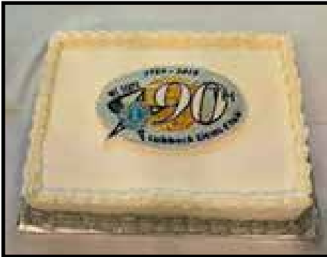
Attendees enjoyed the 90th birthday cake served at the banquet.