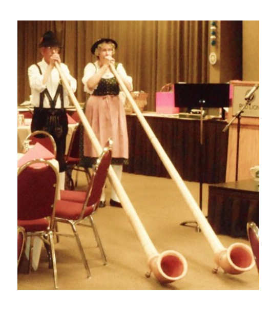
Bavarian Echoes calling us to the Fest Hall for the Friday Night Social!