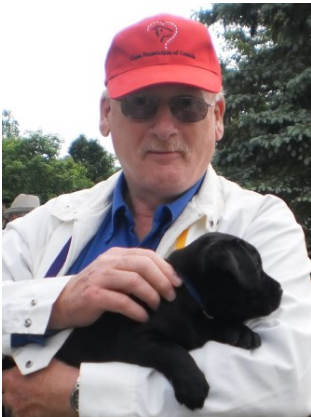
District Governor holding a future dog guide.