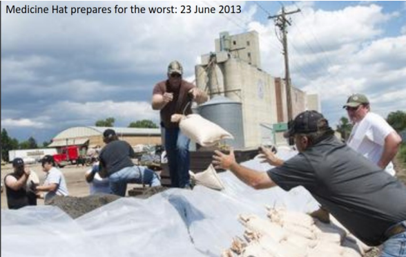
Medicine Hat prepares for the worst: 23 June 2013

If anyone ever asks why we should donate to LCIF show them these pictures. LCIF gave our district $10,000 dollars upon request to aid those displaced by the flood waters in Medicine Hat in this spring's flood. We owe LCIF a great deal of thanks for this.