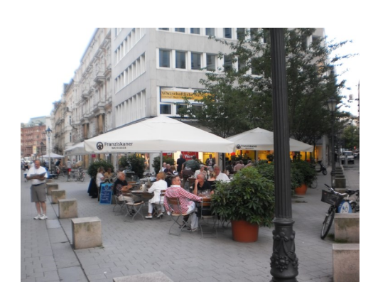
Our favorite open air restaurant