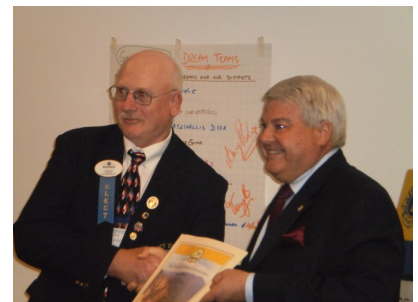
With group leader PCC

It was a very interesting, informative, and expensive (things cost a lot and the euro is worth more than our dollar) time in Hamburg. But, I wouldn't change a thing.