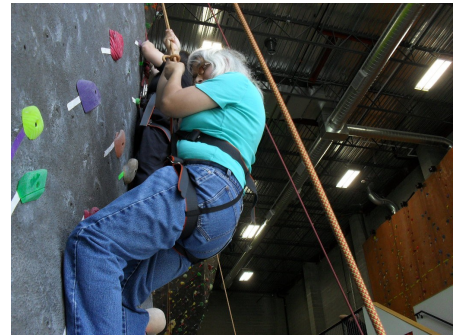
What kind of adventure awaits you?

Send in your $100 deposit NOW to hold your spot! Call Susie at Oral Hull Park, 503-668-6195 for any additional questions, or visit our website to download registration forms. Www.oralhull.org