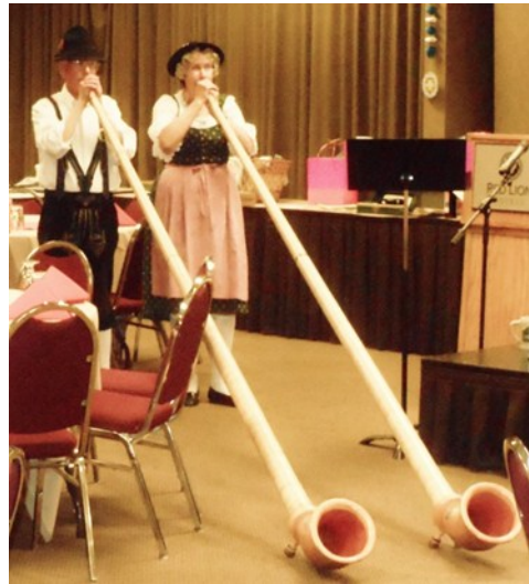
Bavarian Echoes calling us to the Fest Hall for the Friday Night Social!