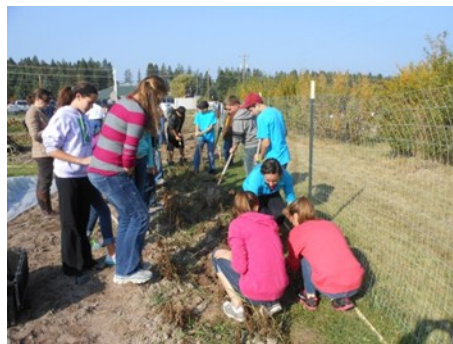
Whitefish Middle School Students digging potatoes after a frost.

We will keep District 37N posted on where to view this video when it becomes available.