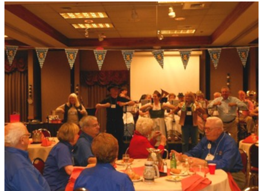
Nothing says fellowship like a chicken dance!