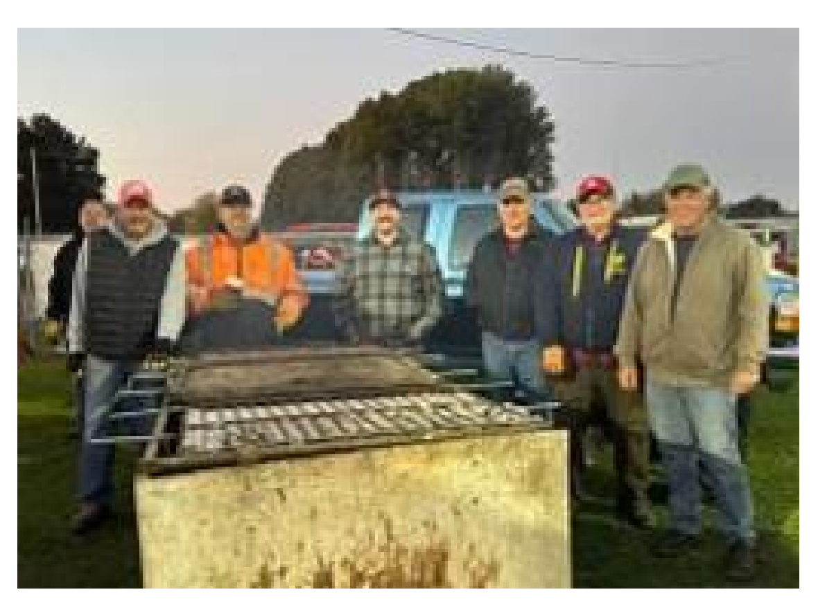
<u>Junction City Lions</u> donated 120 chicken halves and cooked them for the Junction City Booster Club for Senior night football.