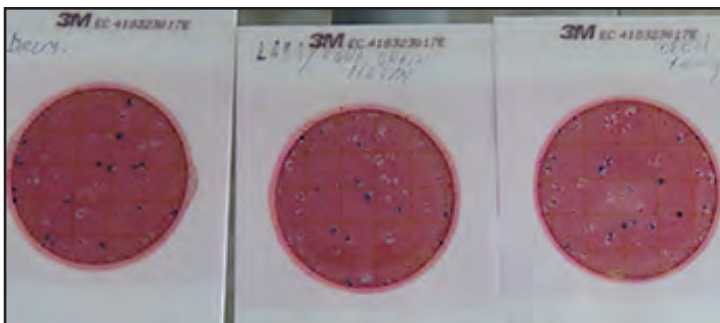
Contaminated drinking water.

Agua Pura has always felt that each family ultimately is responsible for their own children's health. Government help may never come, well-meaning non-profits may help for a while but then leave without any plans or help for the future.