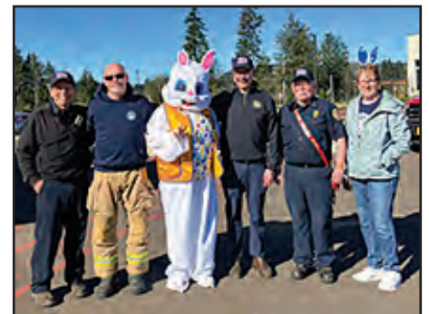
Fire Crew with the Easter Bunny.