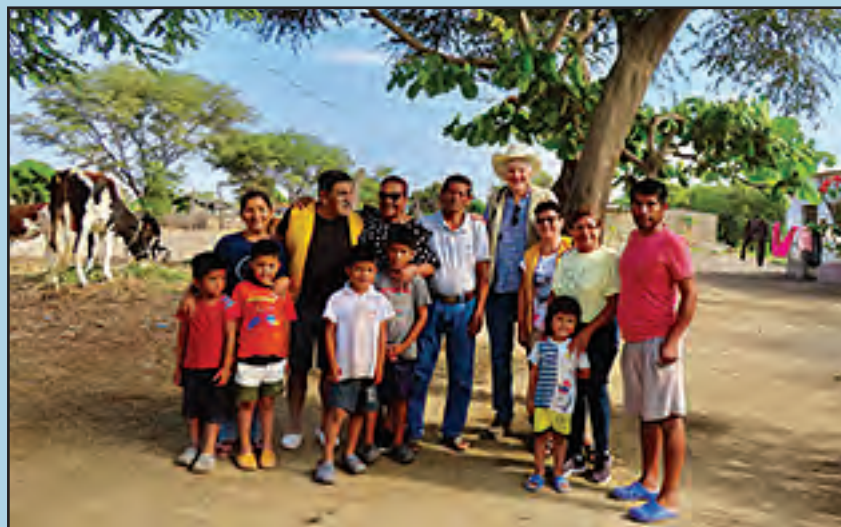
Peru Lions visiting community of Valle Nueva to help with clean water.