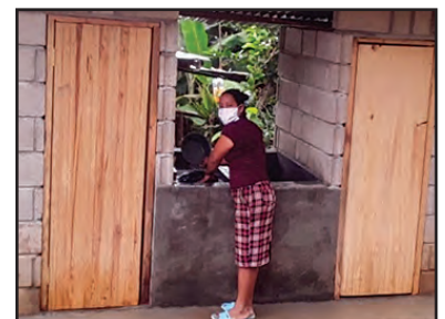
Latrine with shower and clothes washing basin.

The third item is the water well. It serves the whole community and it's the whole communities' responsibility to make it safe. The first step is to close the top of the well so that contaminants cannot fall in. We are encouraging families to come together and develop a plan to cover it. There may be some expense involved and Agua Pura may be help with the costs but the community will be responsible for implementation. The covering should be done soon before contamination worsens.