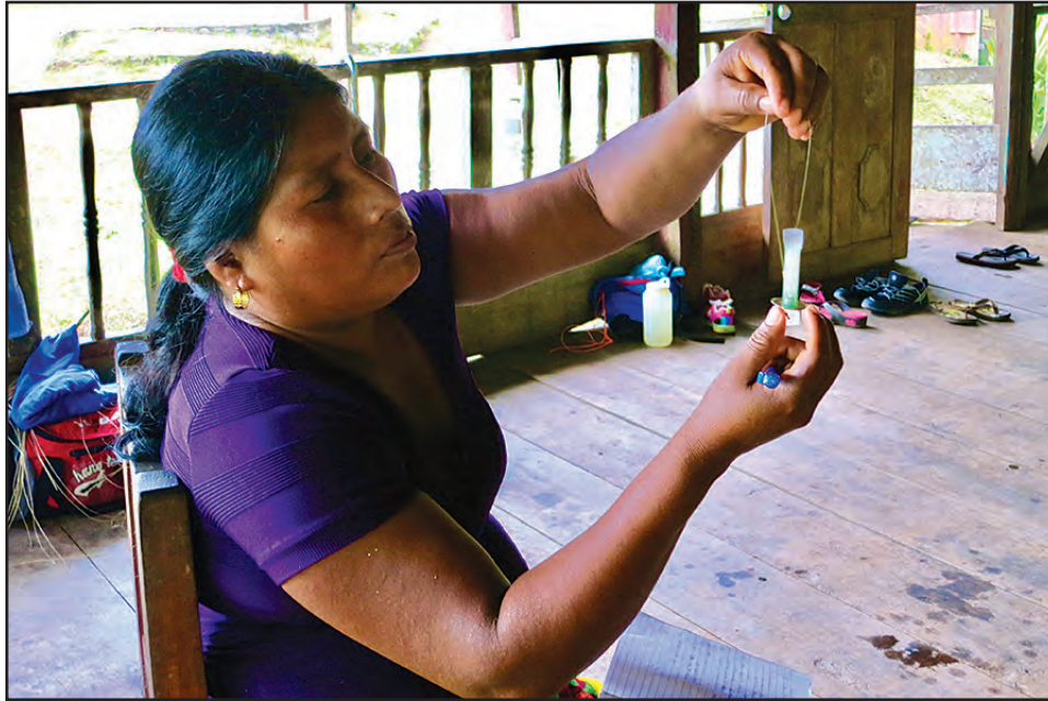
WAPI's in Panama.

At that meeting the first thing we did was to give each family a water pasteurization indicator (WAPI) and demonstrated its use. It's a simple thermometer like device that shows when water has been heated enough to kill all pathogens. We have distributed many thousands of these reusable indicators as a families' first line of defense against contaminated water. Whatever else happens to their supply they can protect their own families drinking water. We also provided a water filter for the school.