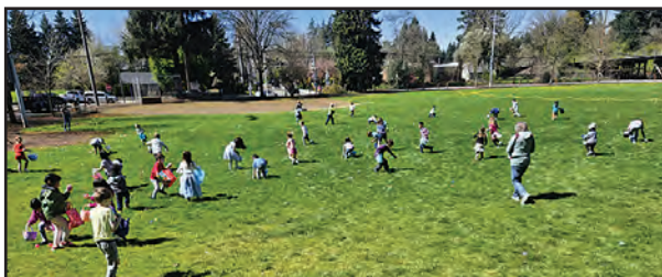
5 and 6 year old group out searching for treats.

Lion Ed Casey worked wonders with the Lions Club popcorn popper, selling many $1 bags of popcorn to families. Families also made cash donations and donations of non-perishable food, all going to support the Tualatin Lions “Back-Pack Buddies” lunch program.