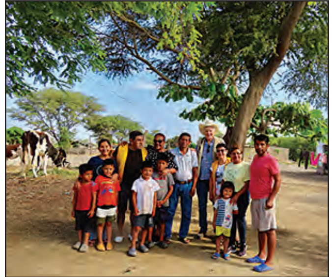
Peru Lions visiting community of Valle Nueva to help with clean water.

Her drinking water came from a deep community well in the fields and was pumped to all the families in the area. The inside lining of the well was old and may be cracked and there was no cover on the well. When tested the water showed signs of potential contamination. Her home has no toilet or latrine because whenever she tried to dig a pit it filled with water. Worse still, because she has no toilet she and her family have to use the surrounding fields to go to the bathroom.