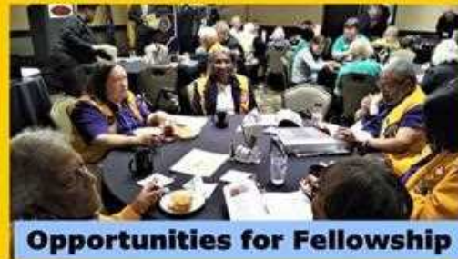
Opportunities for Fellowship

Crowne Plaza Indianapolis Airport January 16-17, 2026