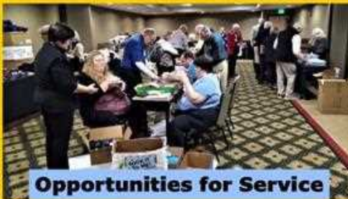
Opportunities for Service

Mark your calendar now for the 2026 Mid-Winter Conference.