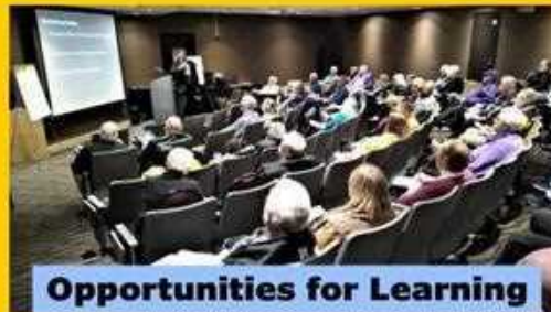
Opportunities for Learning

It's not too early to start planning for 2026.