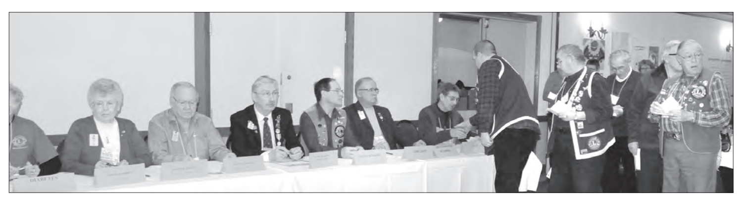
Parade of Green raises over $45,000