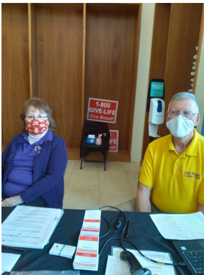
Above: South Windsor Lions ready to check in donors at one of the blood drives at Evergreen Walk

South Windsor Lions have assisted at two blood drives at Evergreen Walk, so far, checking donors in, directing them, and maintaining the snack table supplies and cleaning.