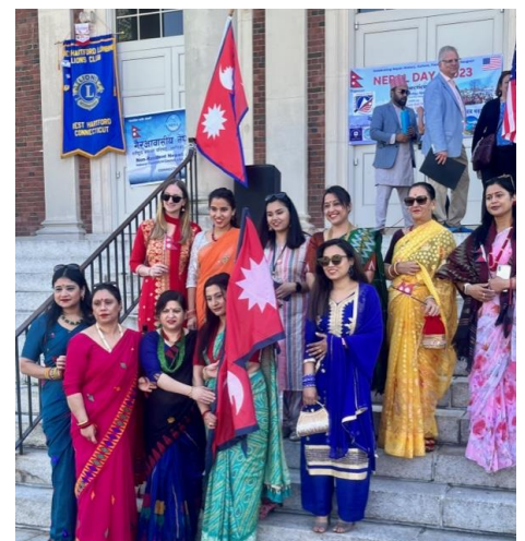
A few pictures from the Celebrating Nepal and other UNA-CT festivities on April 30