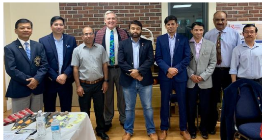
Left and below: A couple of pictures from the joint officer installation with the HCEC and WHLLC