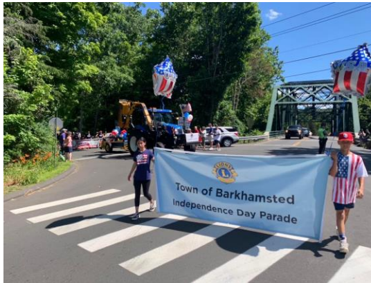
Above: The color guard of the Barkhamsted Independence Day Parade