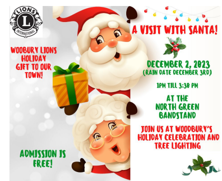
The Woodbury Lions Club arranged for a visit by Santa Claus. Just visit with Santa at the North Green Bandstand from 1 till 3! He arrived by fire truck!