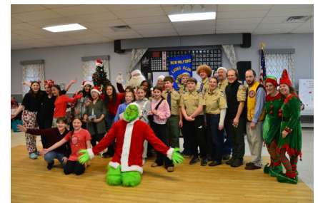
New Milford Lions Club hosted a great Christmas party for 98 seniors. Thanks to the New Milford Leo Club and the Scouts from Troop 58 for all the help! And Santa and the Grinch even showed up! There was singing and dancing and lots of great food and gifts. Thank you to all who donated and helped make this happen.