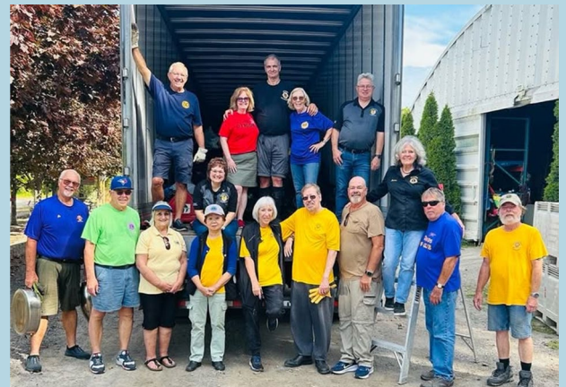
St Davids and District – Soles 4 Souls