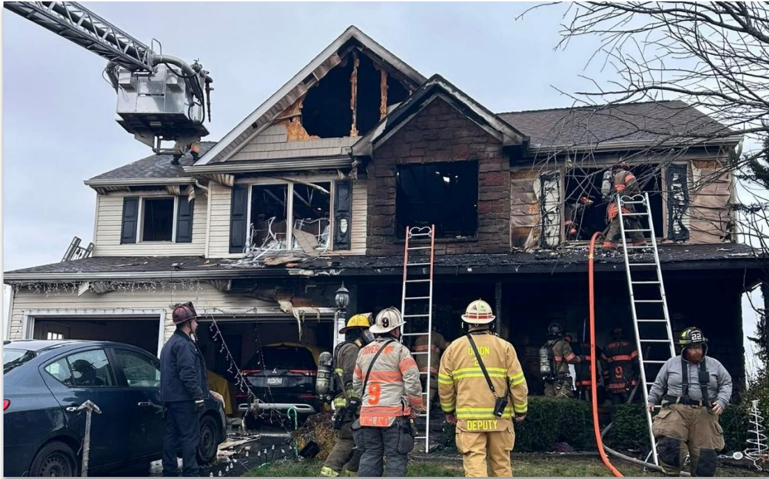
Fire scene at Torrey Pines Drive

On November 30th, a 1st Alarm structure assignment was dispatched to the 200 block of Torrey Pines Drive in East Manchester Township. The home is a complete loss. Six residents were displaced, but fortunately there were no injuries. The Susquehanna Club presented a WalMart Gift Card for $500 to the owners to help to with their recovery from this disaster.