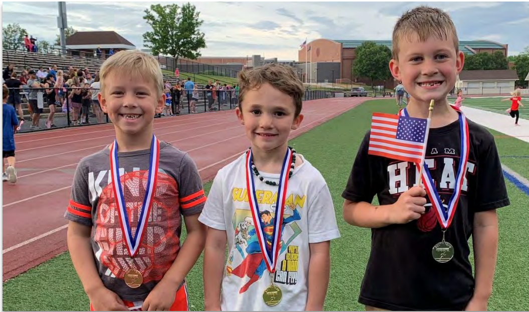
The winners of the Boys 200 m run, 7-8 age group.

The Hanover Club held their 32 nd Annual Kids Night at the Races in May and were faced with incredibly good weather and excited contestants. There were 110 kids who showed up to race and all of them received a celebration ribbon.