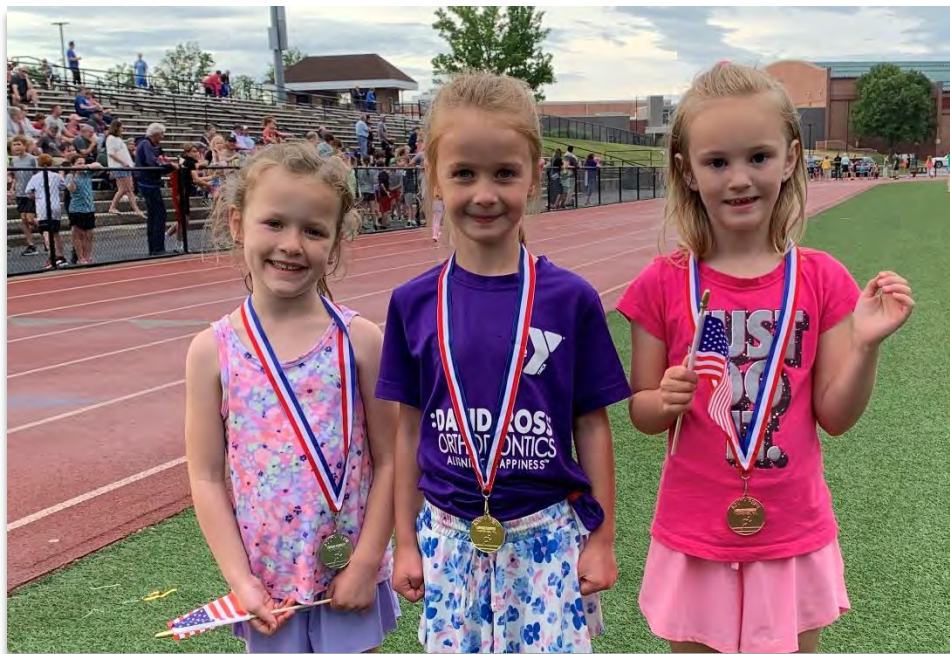
The winners of the Girls 100 m run, 5-6 age group.