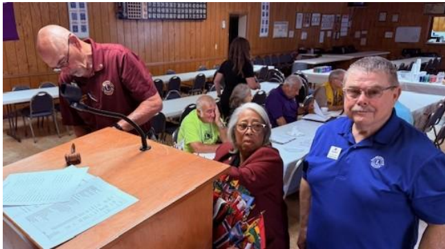
Preparation for service.