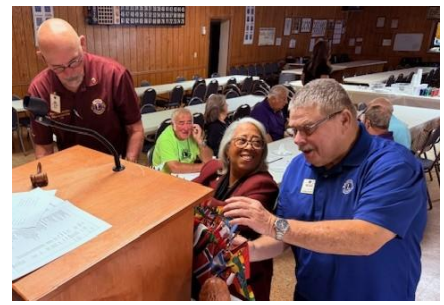
Preparation for service.