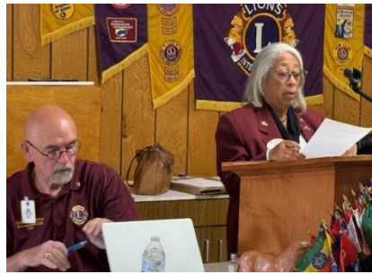
Beginning to serve