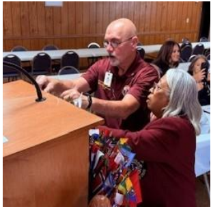
Arranging the flags