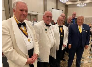
More State Convention Pictures