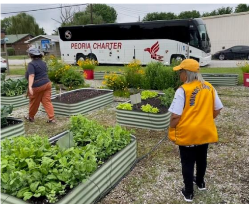
The charter bus passes through Cairo touring different gardens throughout Illinois