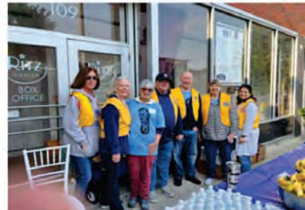
Newburgh Club volunteering at the 5K