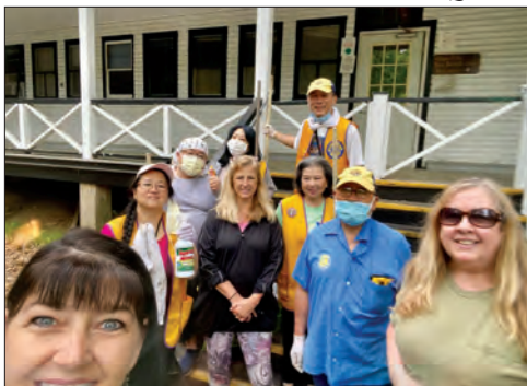
NEW ROCHELLE VCB