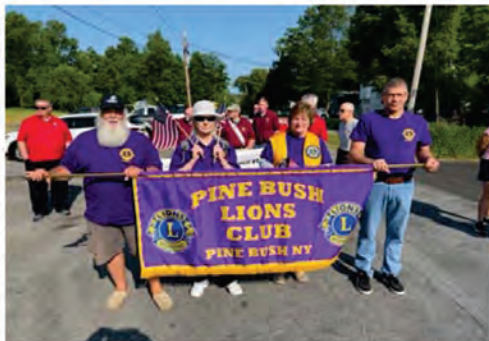
Pine Bush Lions Club Memorial Day Parade