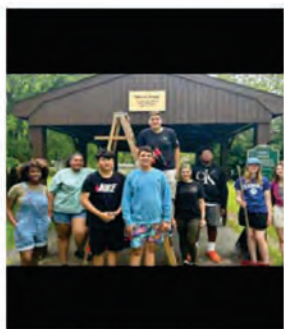
Goshen Leos Park Renovation Project