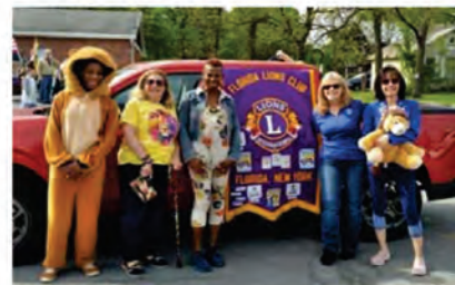
Florida Lions at the Seward Day Parade