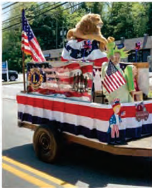
Woodbury Lions Club Memorial Day Parade