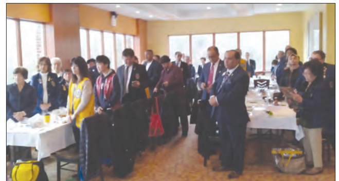
STATEN ISLAND CABINET MEETING