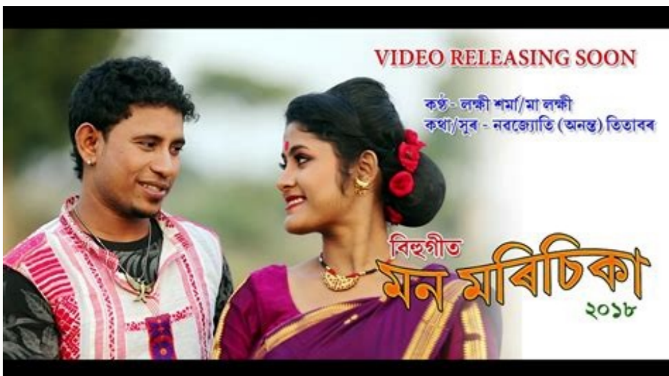
Zubeen garg assamese song bihu gaan. Assamese song bihu gaan 2020. New assamese bihu gaan song. Assamese video - song movies gaan bihu album. Assamese song jaanmoni bihu gaan. Zubeen assamese song bihu gaan. Assamese bihu gaan download song. Assamese bihu gaan mp3 song download.