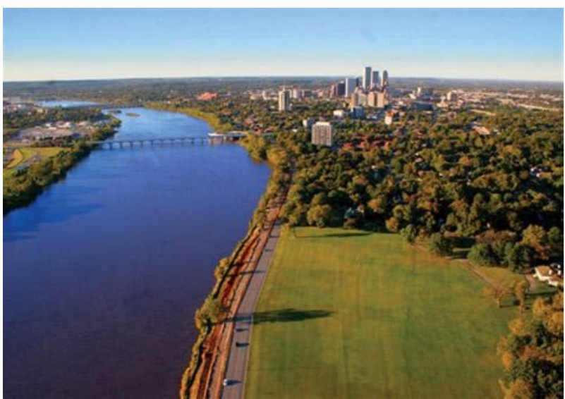
How far is the river questions answers hsslive. How far is the river textbook questions answers. How far is the river questions answers pdf. How far is the river story questions and answers.