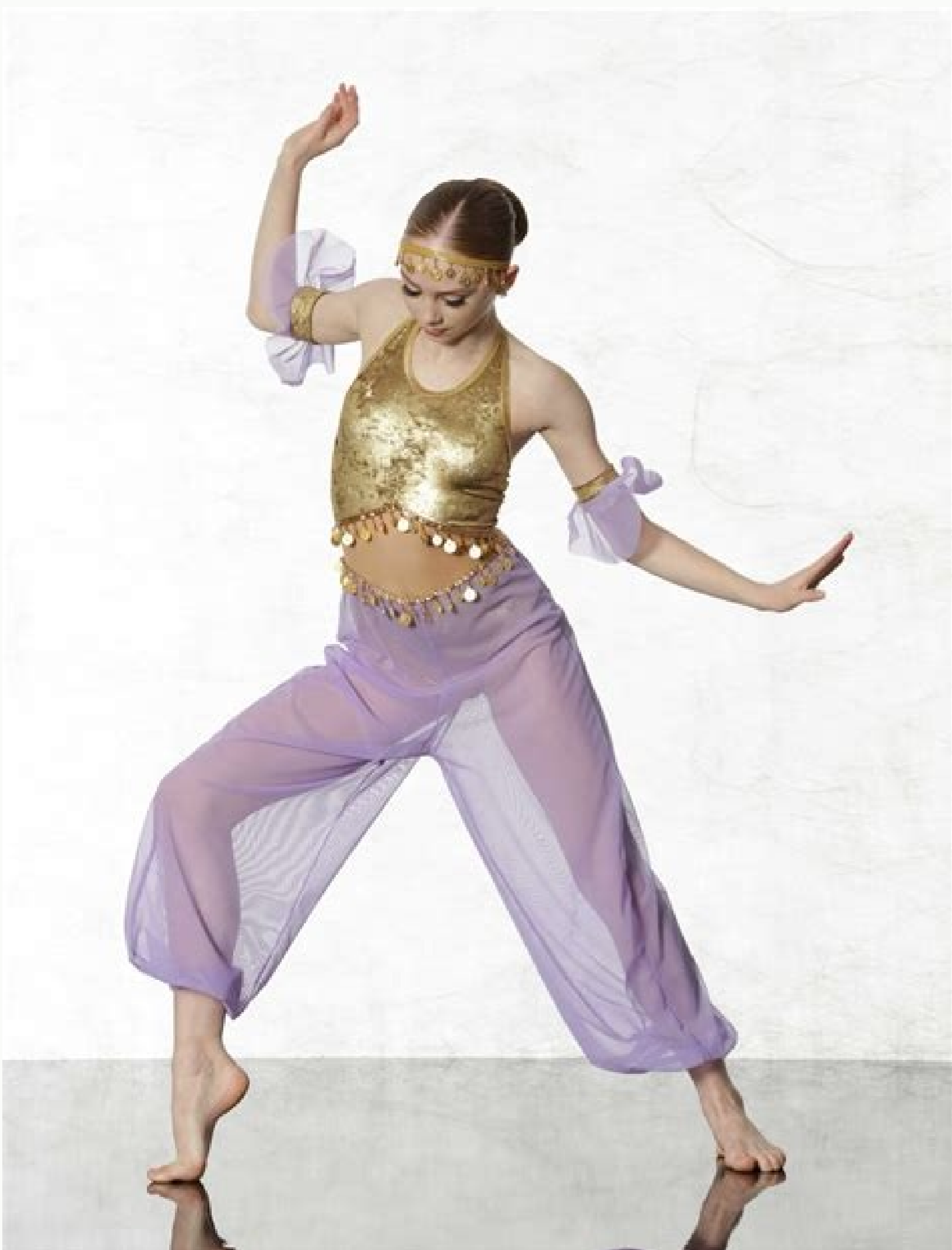
What are the forms of dances. Traditional dances of uae. Arab dance dress name. Types of arabic dance.