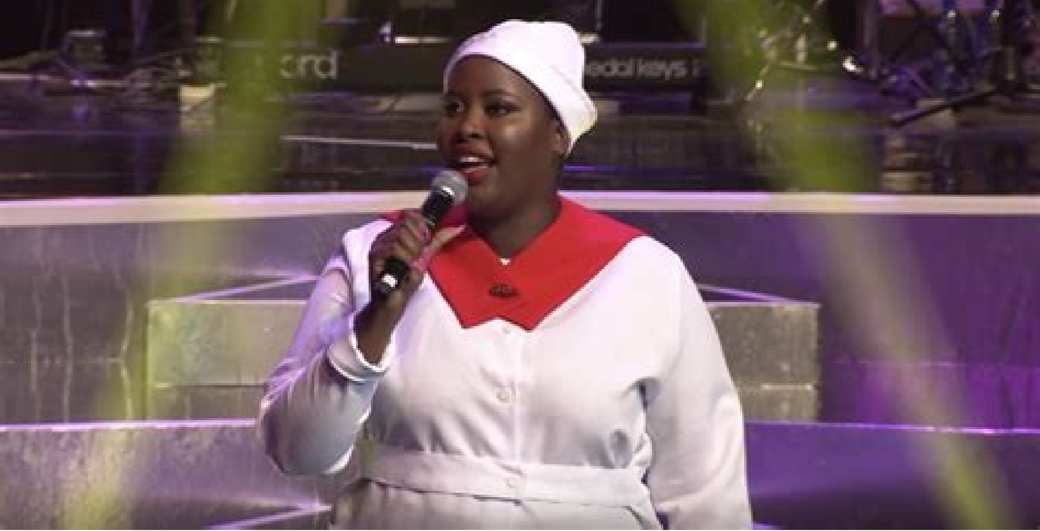
Waptrick joyous celebration music download.